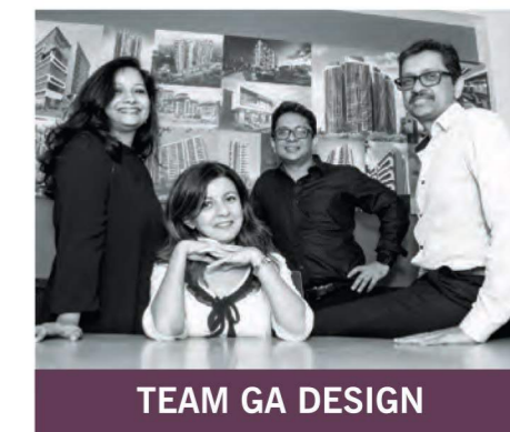
TEAM GA DESIGN