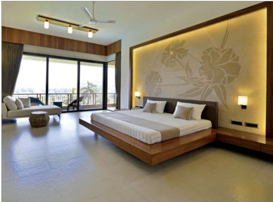
GA Design imbibed local craftsmanship by using Rajasthani craftsmen for the master bedroom's marble backdrop and local experts, adept at stone dressing and fixing, for the exterior Malad stone cladding.