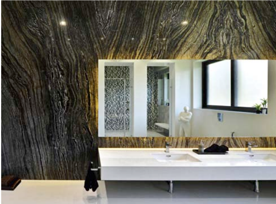
Various stones employed in the rooms of the house have been handpicked to be water resistant and also to provide an exclusive experience in every space.