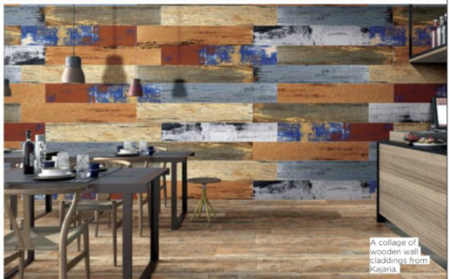
A collage of wooden wall claddings from Kajaria.