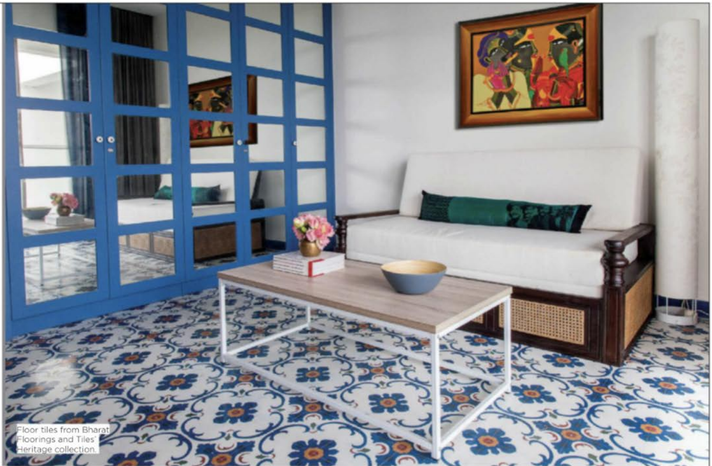
Floor tiles from Bharat Floorings and Tiles' Heritage collection.