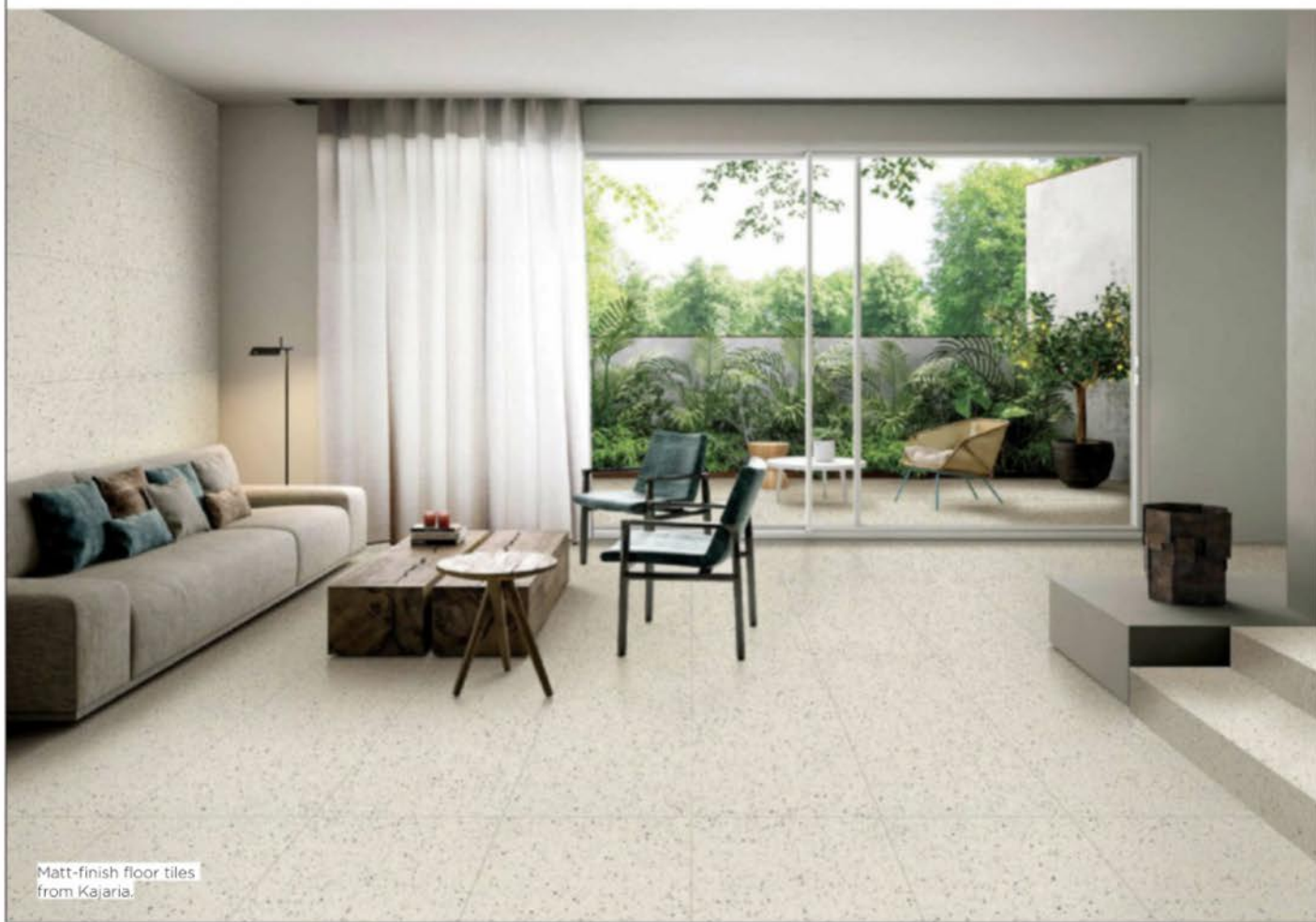
Matt-finish floor tiles from Kajaria.