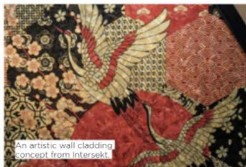
An artistic wall cladding concept from Intersekt.

“Tiles come in many shapes and dimensions; the more we advance with technology the bigger these tiles become. If not a long time ago, tiles of natural stone of dimension of 100 X 100cm were a thing of great cost and were seen only in super high-end projects. Today you can find them in more projects and the prices are more reasonable. Other options that are very popular these days are the granite porcelain tiles that can mimic very closely natural material and can be found in sizes as big as 100 X 300 cm. These tiles are very impressive but hard to handle and work with,” says Israel.