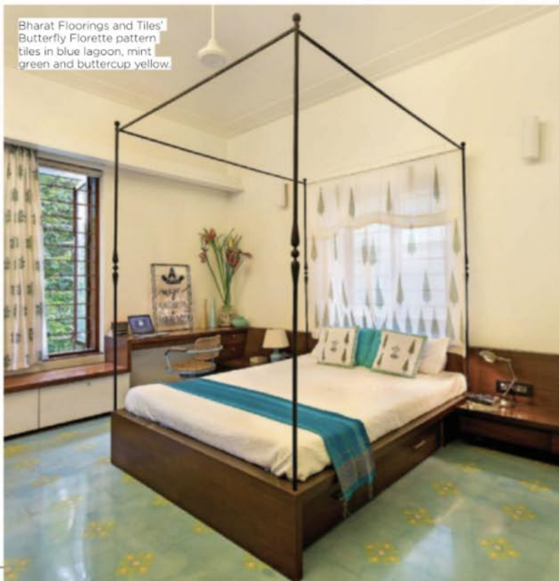
Bharat Floorings and Tiles' Butterfly Florette pattern tiles in blue lagoon, mint green and buttercup yellow.

MAINTENANCE: Somany tile being alkali and weather resistance need minimal care, but to clean and maintain it for longer time, always clean tile with mild detergent or branded floor cleaner (Somany offers Ezy clean, a specifically made formula that is tile friendly and also doesn't harm grouts) with household mop preferably fluffy dust mop (avoid using metallic or rough mops). Another way to clean the tiles are using vacuum cleaner.