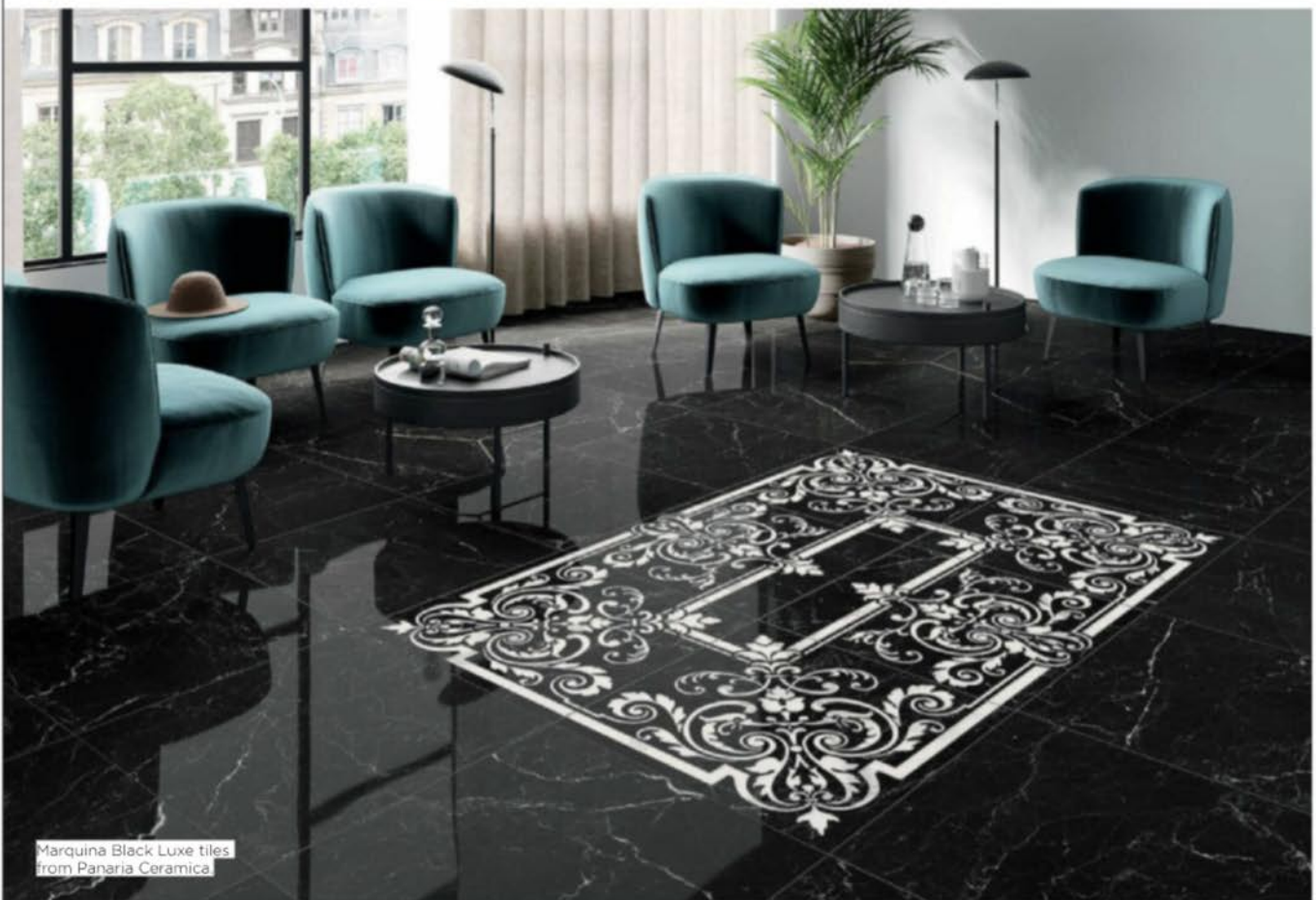
Marquina Black Luxe tiles from Panaria Ceramica

Leather These tiles are exuberant, add warmth to the area and can be used in modern as well as traditional environments. “In terms of application, they are best suited for bedrooms and dressing rooms,” says Satinder.