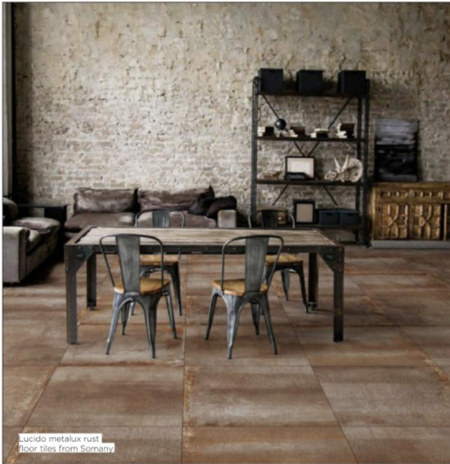
Lucido metalux rust floor tiles from Somany

marble, it is available in different colours and tones. As they are porous and reactive to acidic substances, it requires care and maintenance," says interior designer Deepa Juneja.