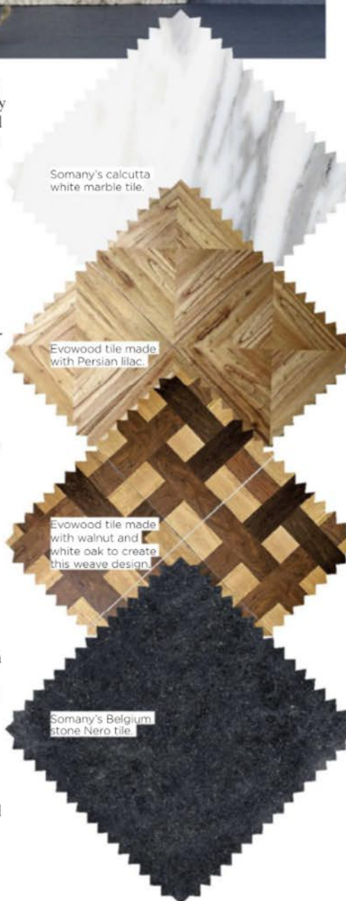
Somany's calcutta white marble tile.

Laminate Tile formats are available today in laminate flooring. The top quality laminate floors have tile designs in wood and ceramic and due to the ease of installation and their scratch resistance, they are one of the most preferred options for bedrooms and living rooms.