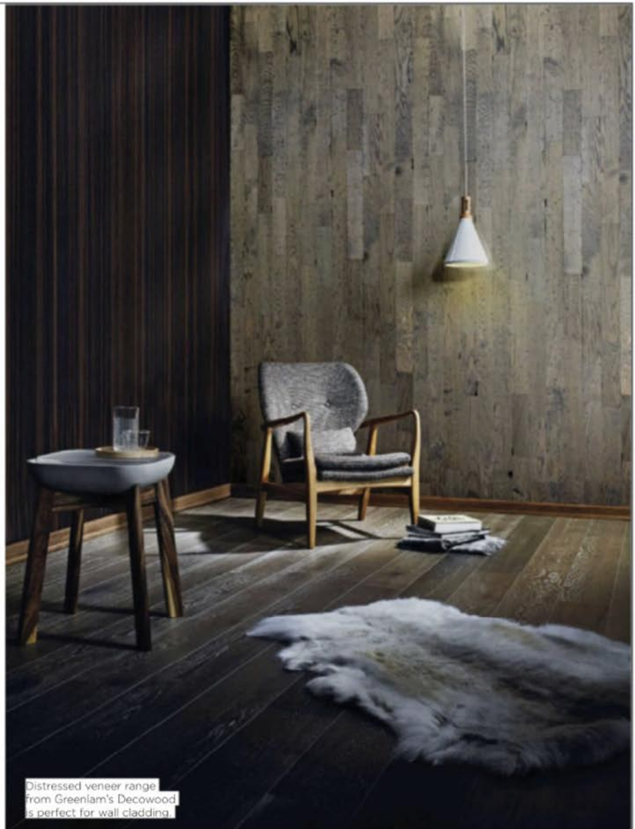
Distressed veneer range from Greenlam's Decowood is perfect for wall cladding.

Travertine A type of limestone, which is porous and natural, travertine is very hard and a durable natural stone. "The pits and rough texture on them are caused by air bubbles and organic matter, which makes them aesthetically appealing and also age beautifully. Considered cheaper than