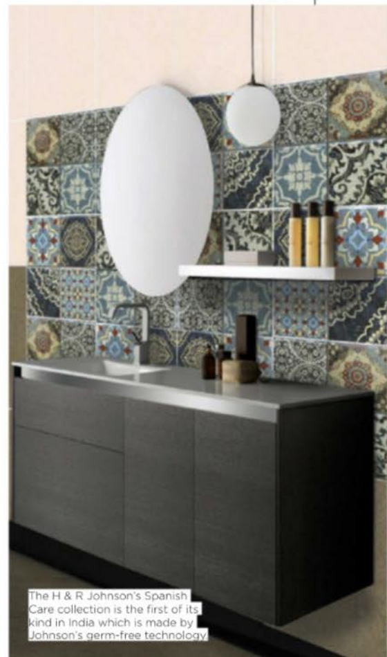
The H & R Johnson's Spanish Care collection is the first of its kind in India which is made by Johnson's germ-free technology.