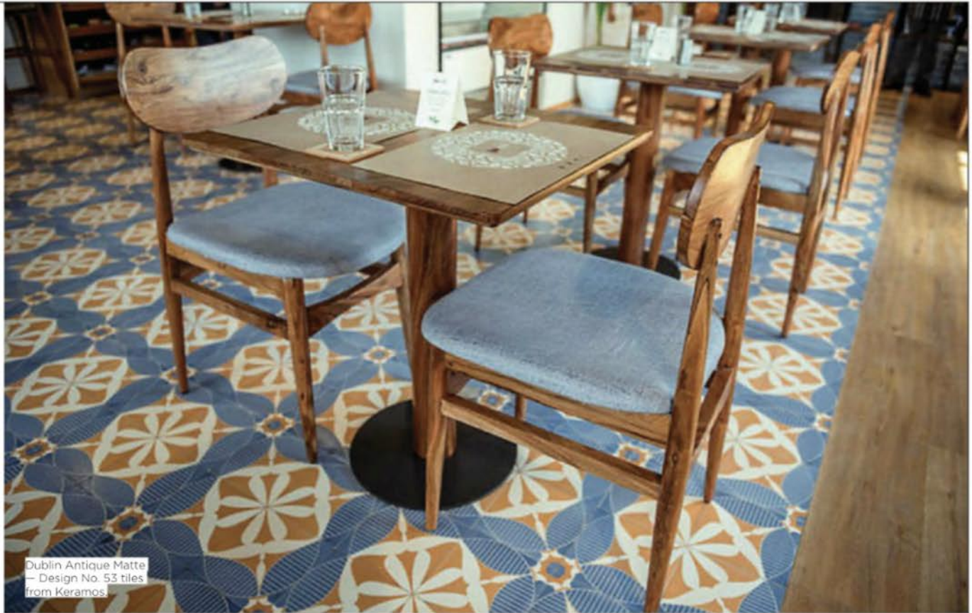
Dublin Antique Matte — Design No. 53 tiles from Keramos.