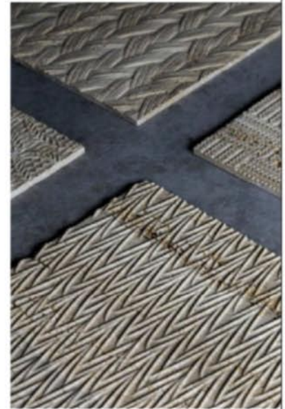
Topstona's Entwine tiles are crafted in travertine marble.

are resistant to stains, mildew, allergens and are easy to clean. Available in a range of aesthetically pleasing colours and patterns, these can be ideal for walls, bathroom walls, kitchen and any space that can use some additional light."