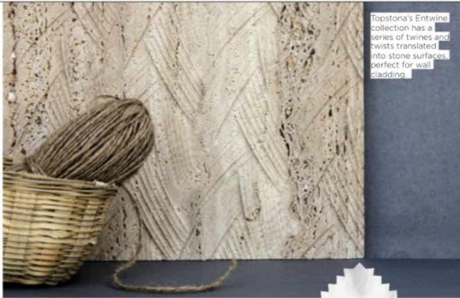
Topstona's Entwine collection has a series of twines and twists translated into stone surfaces, perfect for wall cladding.