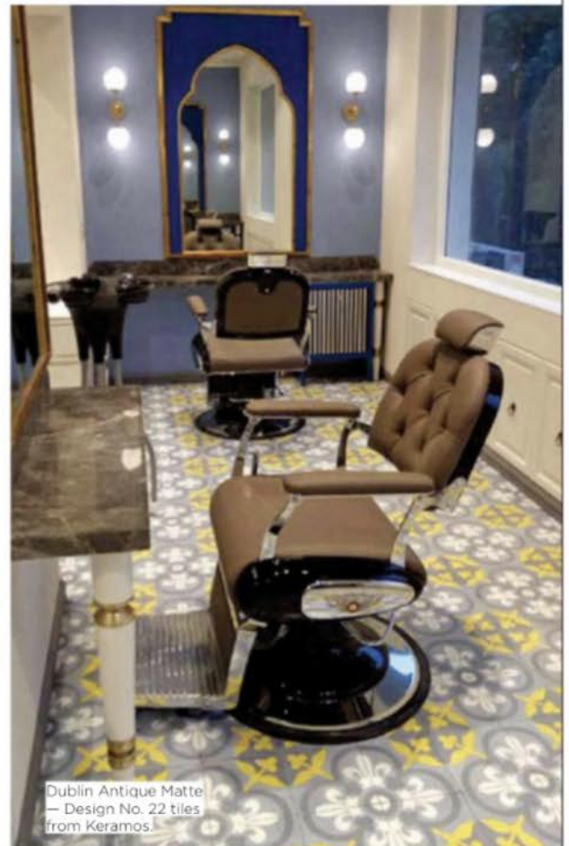
Dublin Antique Matte — Design No. 22 tiles from Keramos.